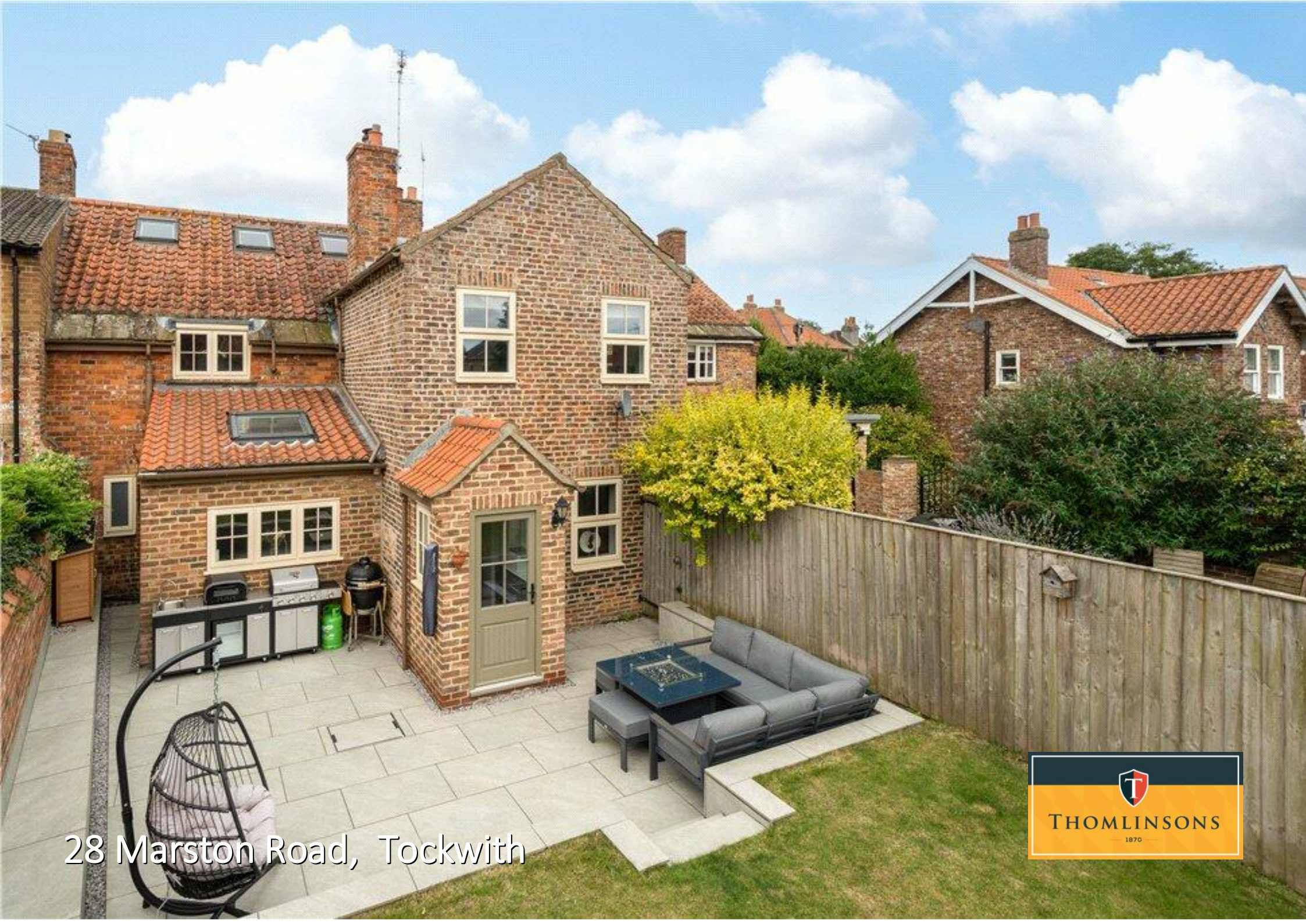
28 Marston Road, Tockwith